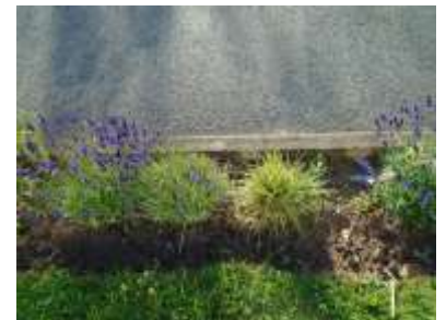
Lavender looking good!